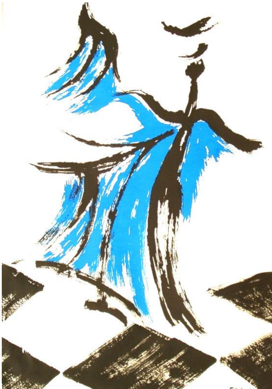
Blue Dancer Chess - Serigraph with acrylic paint by Elke Rehder

Elke Rehder used this printing technique from 1990 to 1999 for her colorful large posters like "Blue Dancer Chess" or the chess prints "Knight takes Rook"