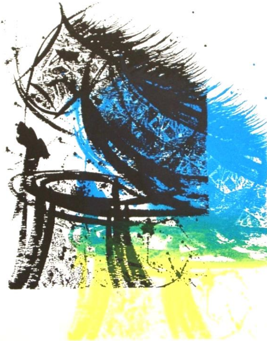
Chess - Knight takes Rook - Serigraph in variation blue, black, yellow by Elke Rehder