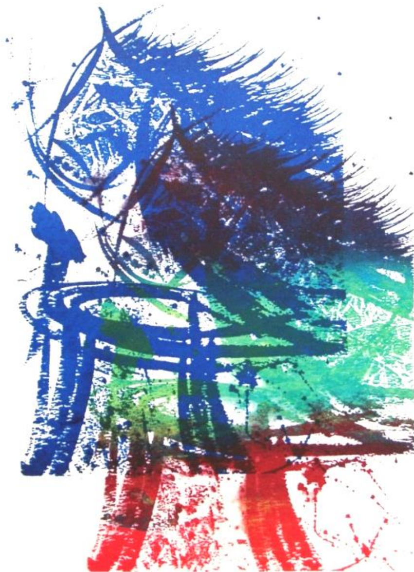
Chess - Knight takes Rook - Serigraph in variation blue, green, red by Elke Rehder