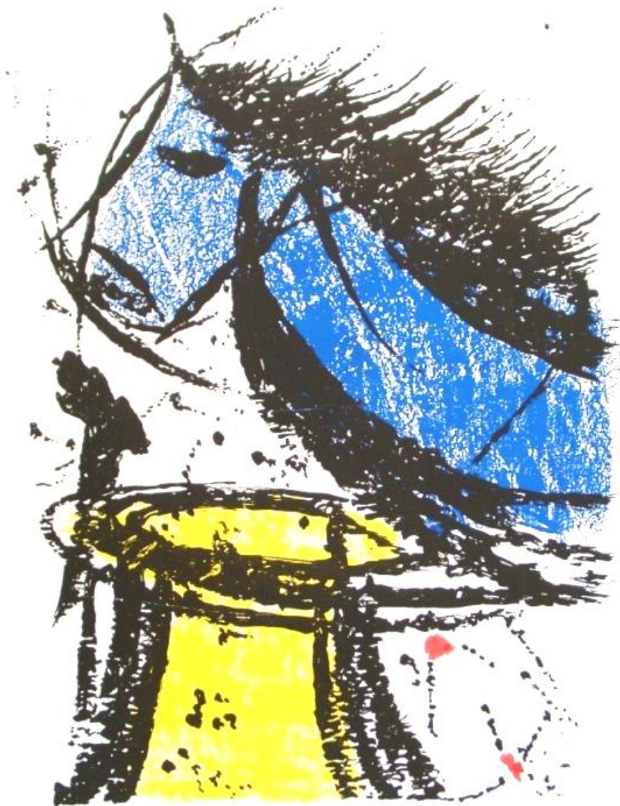
Chess - Knight takes Rook - Serigraph by Elke Rehder