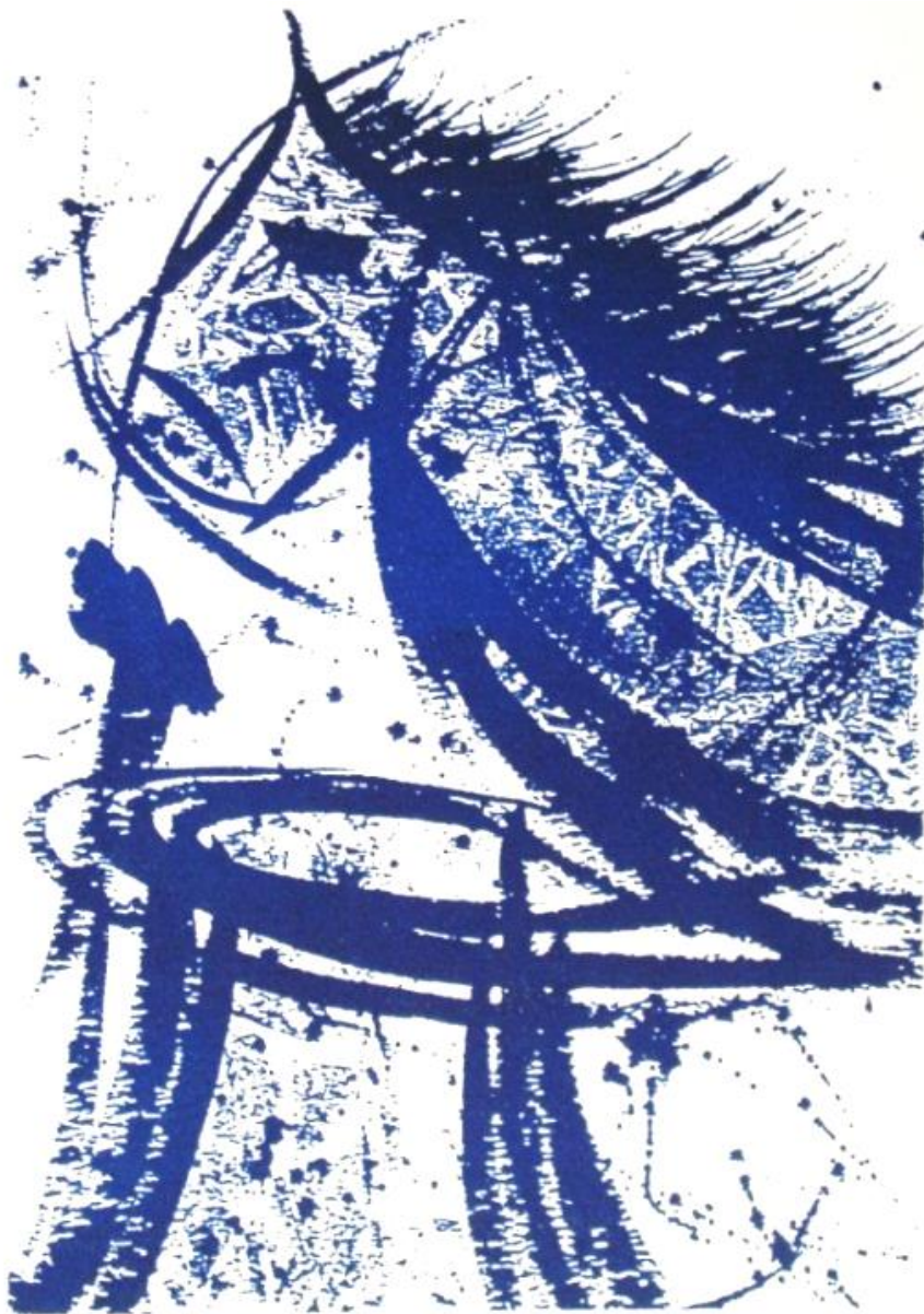
Chess - Knight takes Rook - variant in dark blue by Elke Rehder