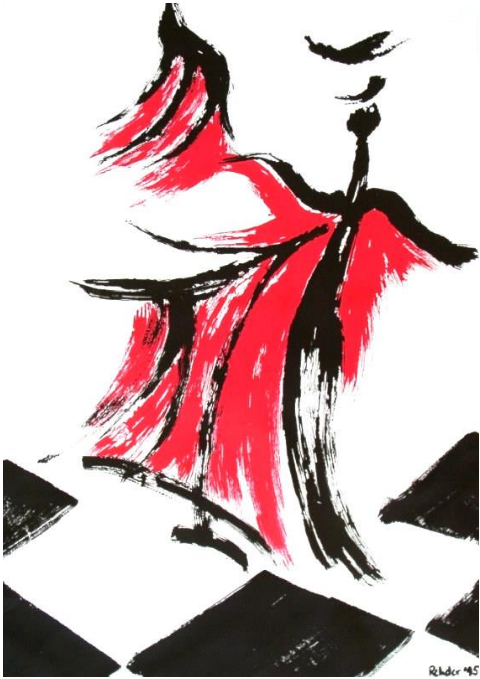
Red Dancer Chess - Serigraph with acrylic paint by Elke Rehder