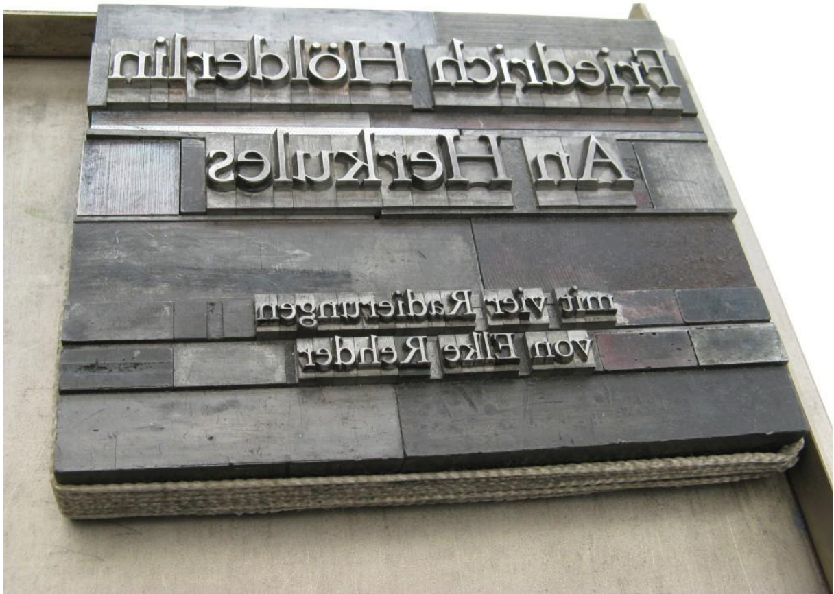
Here is a block of type tied up in the corner of a so called type galley.