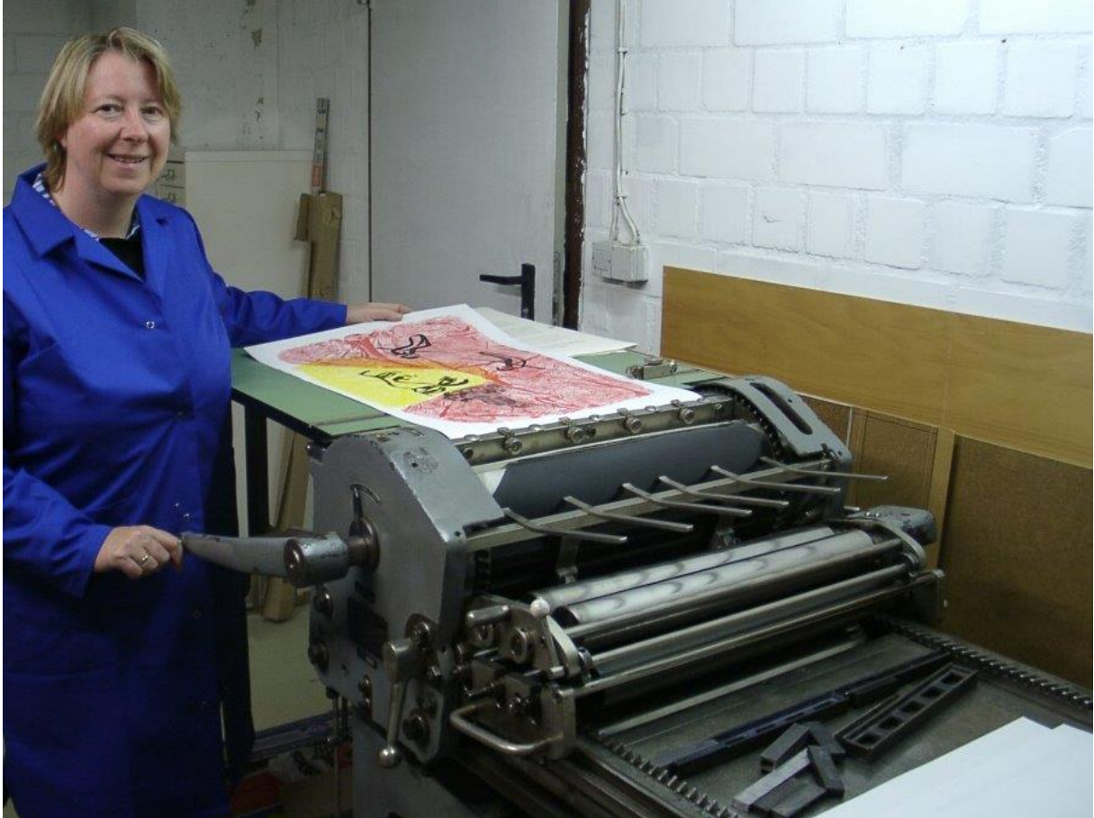
This is my old Korrex flatbed cylinder proof press, manufactured in 1961 by Max Simmel in Berlin.